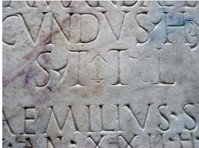
STTL (SIT TIBI TERRA LEVIS)