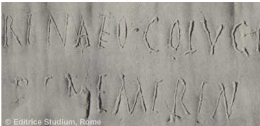
FIG. 29. Epitaph of Renatus . Rome, Lateran Museum (from the cemetery of Sant 'Ermete).