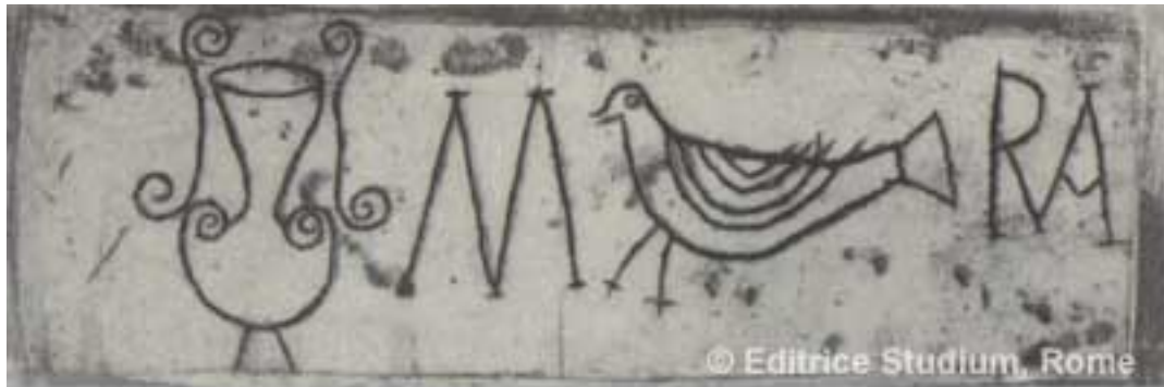
FIG. 30. Christian epitaph. Lapidary of the Vatican Museums.