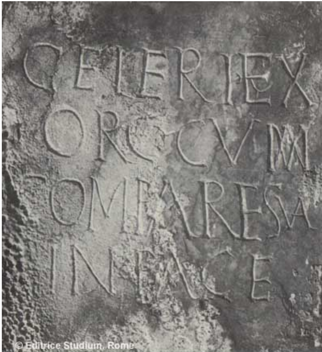
FIG. 31. Epitaph of the exorcist Celer . Rome, cemetery of St. Callistus.