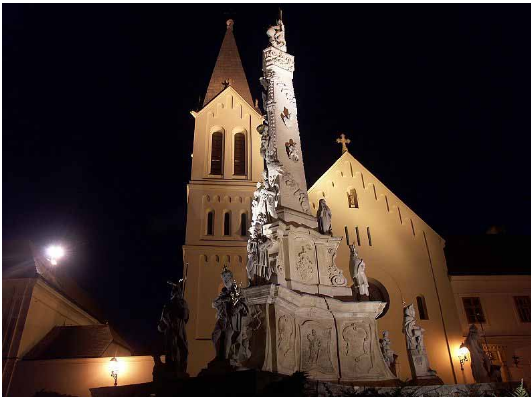
The Basilica of Veszprém