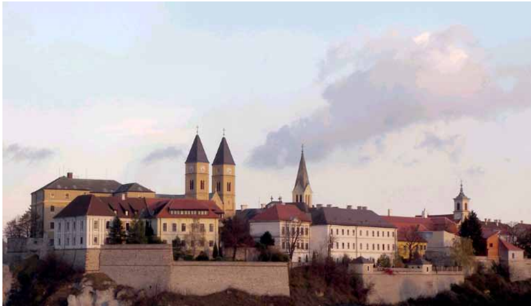
Veszprém (Veszprém Castle) Veszprém was well liked by medieval Hungarian queens. „The Town of Queens”