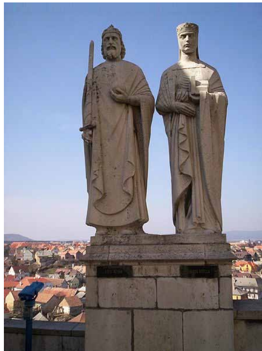
King Stephen I. and Queen Gisela