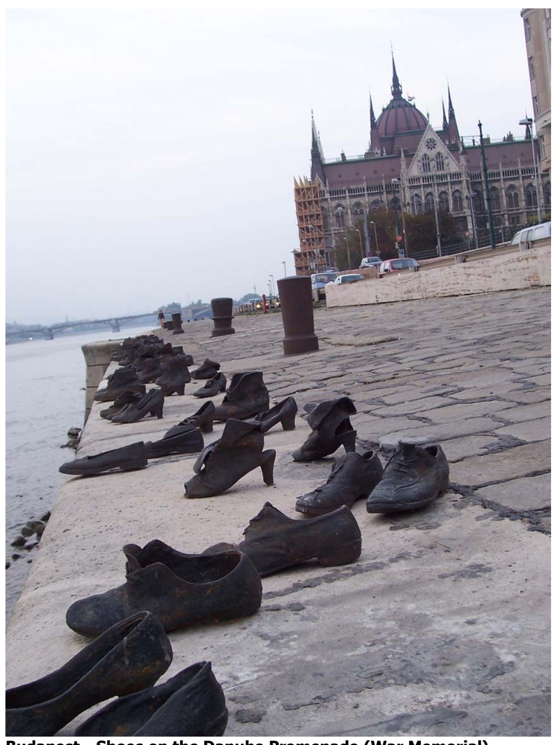
Budapest - Shoes on the Danube Promenade (War Memorial)

http://www.youtube.com/watch?v=4rDgs9tYdVw Budapest 1944 október Duna-part (with music 6:14)