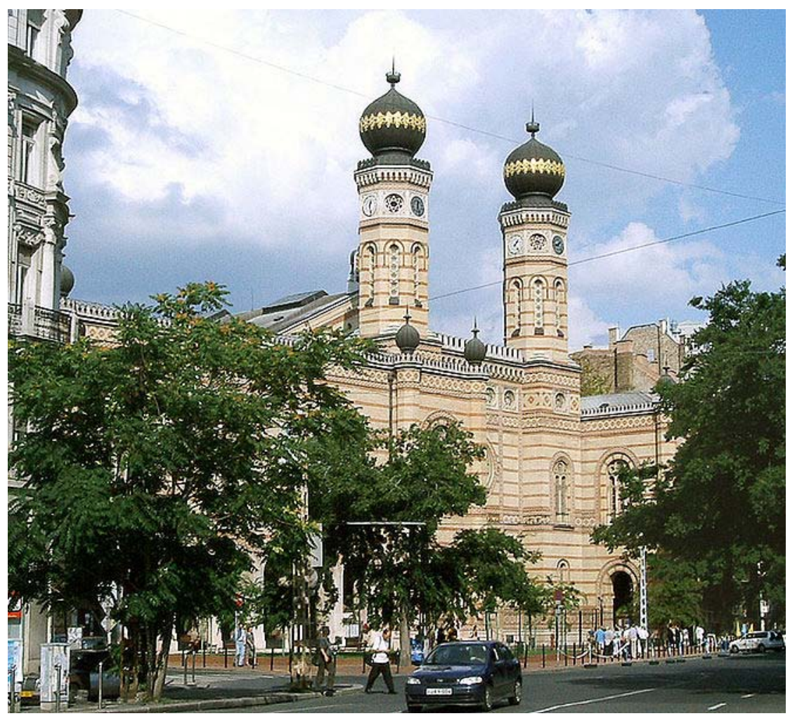
Dohány Street Synagogue, Budapest.

This is the second largest synagogue in the world, after the Temple Emanu-El. It is 75m long and 27m wide, and was built between 1854 and 1859 in the Moorish Revival style, based chiefly on Moorish models from North Africa and Spain. It seats 3,000 people and is a centre of Neolog Judaism.