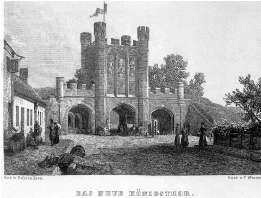
The Königstor (King's Gate) in the 19th century

In the König Strasse (King Street) stood the Academy of Art with a collection of over 400 pictures. About 50 works were by Italian masters; and some early Dutch paintings were also to be found there. At the Königstor (King's Gate) stood statues of King Ottakar I of Bohemia, Albert of Prussia, and Frederick I of Prussia. Königsberg had a magnificent Exchange (completed in 1875) with fine views of the harbor from the staircase. Along Bahnhof Strasse ("Railway Street") were the offices of the famous Royal Amber Works — Samland was celebrated as the "Amber Coast". There was also an observatory fitted up by the astronomer Friedrich Bessel, a botanical garden, and a zoological museum. The "Physikalisch", near the Heumarkt, contained botanical and anthropological collections and prehistoric antiquities. Two large theatres built during the Wilhelmine era were the Stadt (city) Theatre and the Appollo.