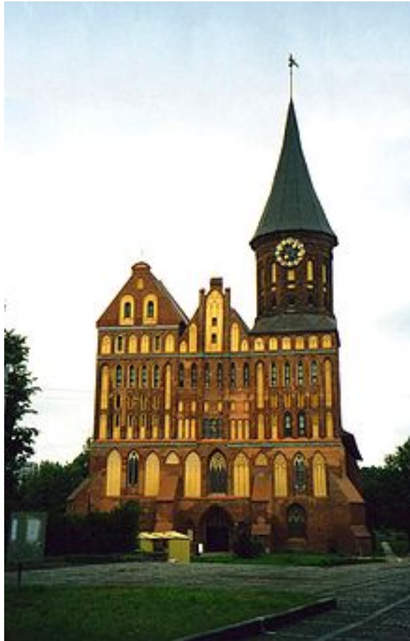
The 14th century Königsberg Cathedral

Through the preachings of the Bishop of Samland, Georg von Polenz, Königsberg became predominantly Lutheran during the Protestant Reformation. After summoning a quorum of knights to Königsberg, Grand Master Albert of Brandenburg from the Hohenzollern dynasty secularised the Teutonic Knights' remaining territories in Prussia in 1525 and converted to Lutheranism. By paying feudal homage to his uncle, King Sigismund I of Poland, Albert became the first duke of the new Duchy of Prussia, a fief of Poland. While the Prussian estates quickly allied with the duke, the Prussian peasantry would only swear allegiance to Albert in person at Königsberg, seeking the duke's support against oppressive nobility. After convincing the rebels to lay down their arms, Albert had several of their leaders executed. Königsberg, the capital of the duchy, became one of the biggest cities and ports of Prussia, having considerable autonomy, a separate parliament and currency, and with German as its dominant language. The city flourished through the export of wheat, timber, hemp, and furs, as well as pitch, tar, and ash. Königsberg was one of the few Baltic ports regularly visited by more than one hundred ships annually in the latter