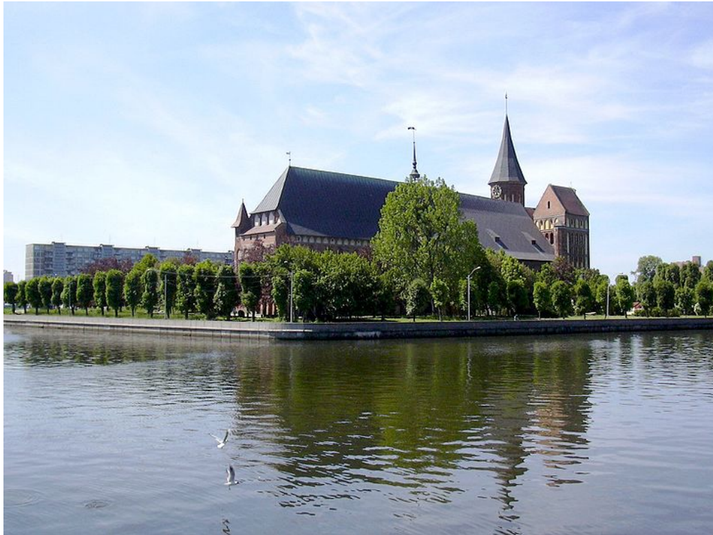
Königsberg Cathedral 柯尼斯堡大教堂