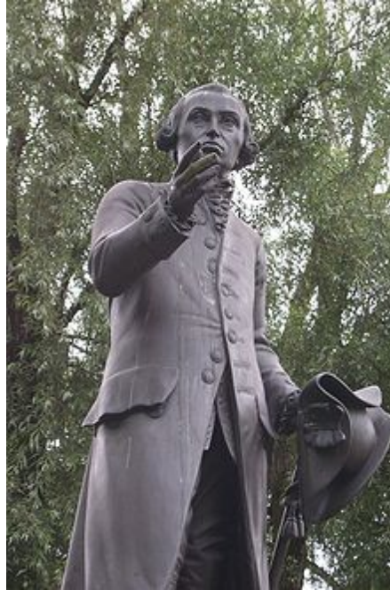
Statue of Immanuel Kant 康德 in Kaliningrad

Königsberg was the birthplace of the mathematician Christian Goldbach and the writer E.T.A. Hoffmann, as well as the home of the philosopher Immanuel Kant, who lived there all his life and never travelled more than a hundred miles away from the city. Kant entered the university of Königsberg at age 16 and was appointed to a chair in metaphysics there in 1770 at the age of 46. While working there he published his Critique of Pure Reason (arguing that knowledge of time and space arises as a mental precondition to sensory experience) and his Metaphysics of Morals which argues that virtue is acquired by the performance of duty for its own sake. In 1736, the mathematician Leonhard Euler used the arrangement of the city's bridges and islands as the basis for the Seven Bridges of Königsberg Problem, which led to the mathematical branches of topology and graph theory. In the 19th century Königsberg was the birthplace of the influential mathematician David Hilbert. The dialect spoken by most citizens was Low Prussian. A popular dish from the city was Königsberger Klopse.