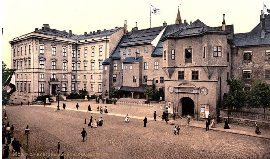
Eastern side of Königsberg Castle, ca. 1900.

Königsberg Castle was one of the city's most notable structures. The former seat of the Grand Masters of the Teutonic Knights and the Dukes of Prussia, it contained the Schlosskirche, or palace church, where Frederick I was crowned in 1701 and William I in 1861. It also contained the spacious Moscowiter-Saal, one of the largest halls in the German Reich, and a museum of Prussian history.