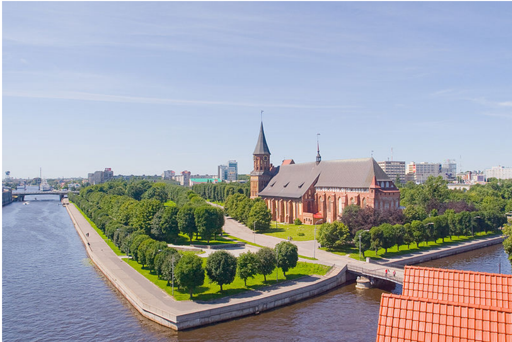
Old Königsberg remains amid modern Kaliningrad

principle to the proposal of the Soviet Government concerning the ultimate transfer to the Soviet Union of the city of Königsberg and the area adjacent to it as described above, subject to expert examination of the actual frontier. The President of the United States and the British Prime Minister have declared that they will support the proposal of the Conference at the forthcoming peace settlement.