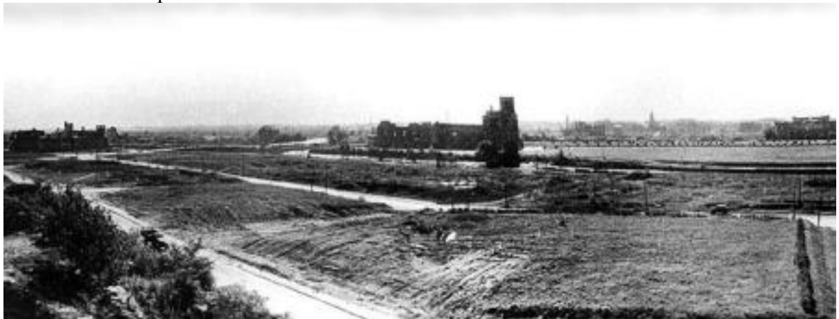
What remained of Königsberg City Centre in 1949

About 120,000 survivors remained in the ruins of the devastated city. These survivors, mainly women, children and the elderly and a few others who returned immediately after the fighting ended, were held as virtual prisoners until 1949. The large majority of German citizens remaining in Königsberg after 1945 died of either disease, starvation or revenge driven ethnic cleansing. The remaining 20,000 German residents were expelled in 1949-50.