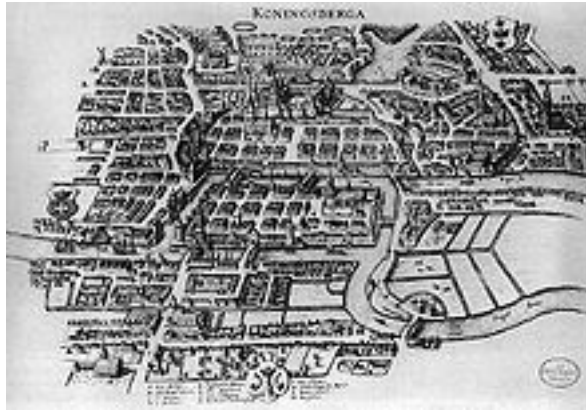
Map of Königsberg from 1651.