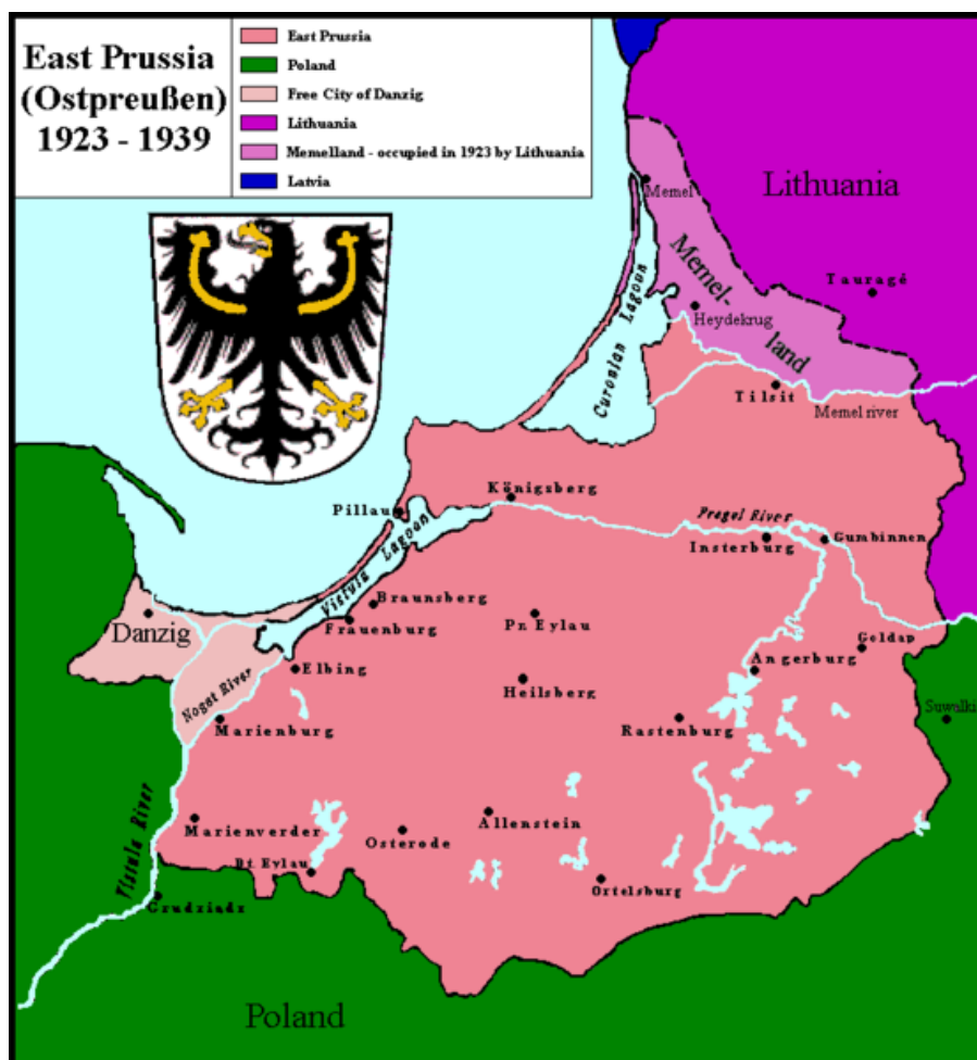
Königsberg within the borders of East Prussia from 1919 to 1939.