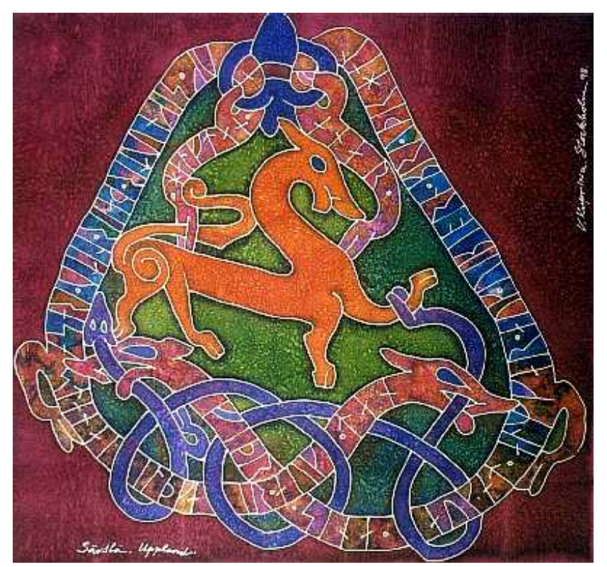
Rune Stone at Sävsta was carved in the XI century by famous the master Bali <a href="http://www.algonet.se/~runesilk/silke/RS1.htm">http://www.algonet.se/~runesilk/silke/RS1.htm</a>