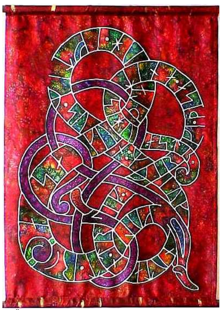
Rune Stone from Östra Ryd Church <a href="http://www.algonet.se/~runesilk/silke/RS1.htm">http://www.algonet.se/~runesilk/silke/RS1.htm</a>

耶靈墓地的墳塚和一個古代北歐文字的石碑是北歐文化中的異教徒文化的典型範例,而其他北歐文字的石碑和教堂則詮釋了進入10世紀中期時,丹麥人逐漸基督教化的進程。